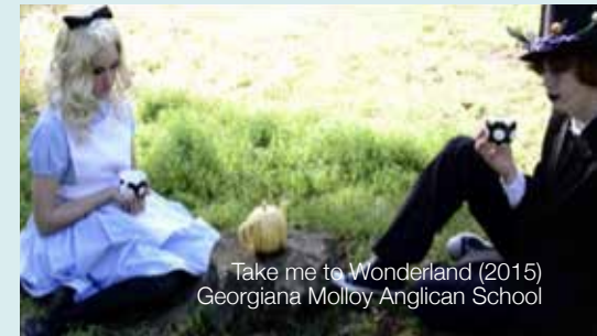
Take me to Wonderland (2015) Georgiana Molloy Anglican School

The content is moderate in impact. Films and computer games classified M (Mature) contain content of a moderate impact and are recommended for teenagers aged 15 years and over. Children under 15 may legally access this material because it is an advisory category. However, M classified films and computer games may include classifiable elements such as violence and nudity of moderate impact that are not recommended for children under 15 years. Parents and guardians may need to find out more about the film or computer game's specific content, before deciding whether the material is suitable for their child.