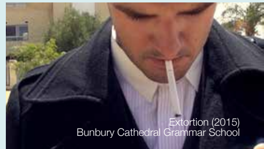
Extortion (2015) Bunbury Cathedral Grammar School