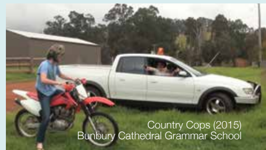
Country Cops (2015) Bunbury Cathedral Grammar School