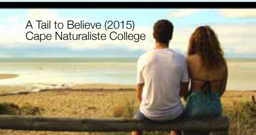
A Tail to Believe (2015) Cape Naturaliste College