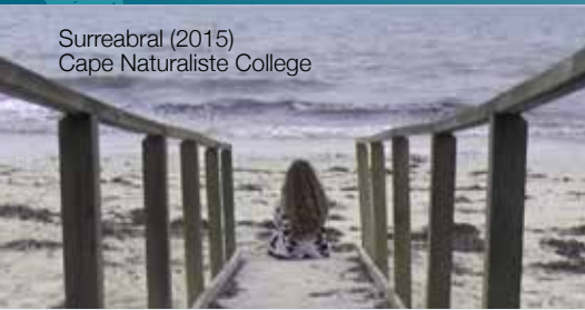
Surreabral (2015) Cape Naturaliste College