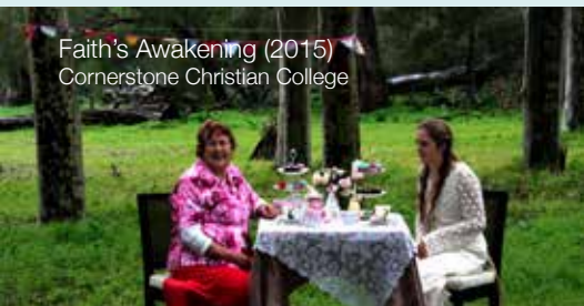
Faith's Awakening (2015) Cornerstone Christian College