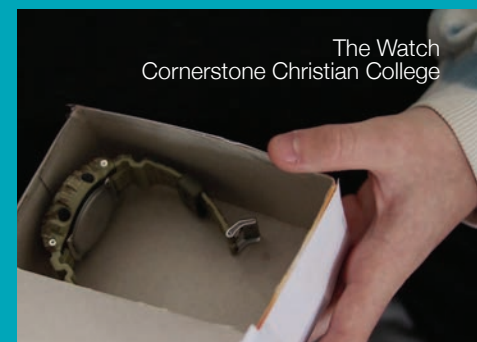
The Watch Cornerstone Christian College