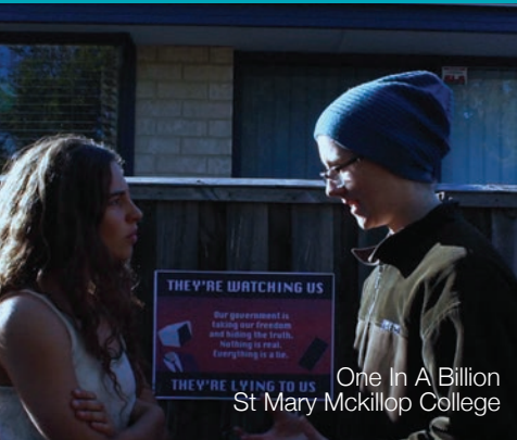
One In A Billion St Mary Mckillop College