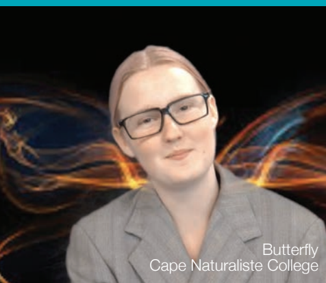
Butterfly Cape Naturaliste College