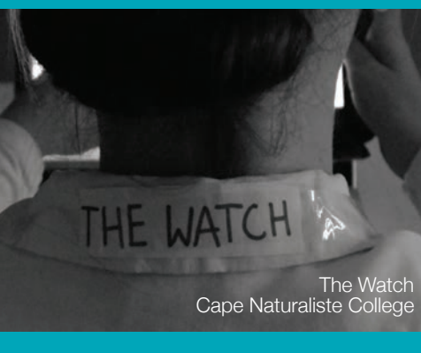
The Watch Cape Naturaliste College