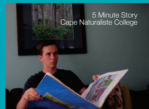
5 Minute Story Cape Naturaliste College