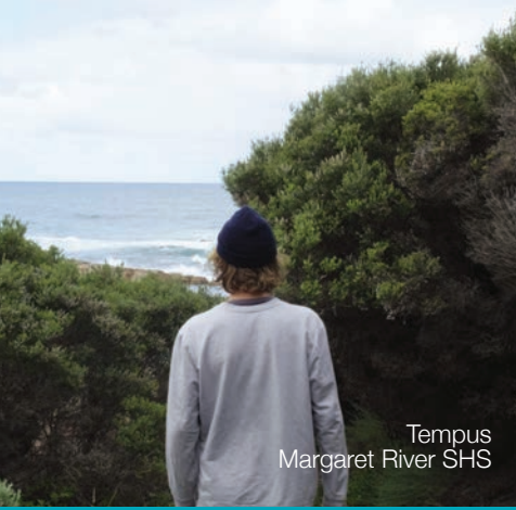
Tempus Margaret River SHS

X 18+ – Restricted RC – Refused Classification