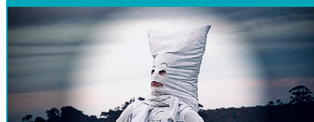
Pillow Dude and the unexpected weird attack of Mr Bellybutton Fluff (2021) Great Southern Grammar