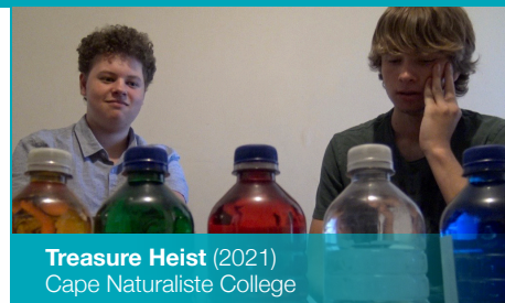
Treasure Heist (2021) Cape Naturaliste College