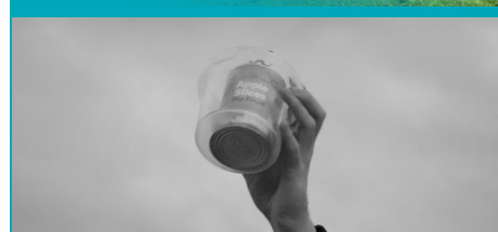
One Man's Trash (2021) Great Southern Grammar