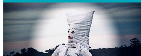
Pillow Dude and the unexpected weird attack of Mr Bellybutton Fluff (2021) Great Southern Grammar