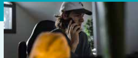
Aversion (2022) Bunbury Cathedral Grammar School