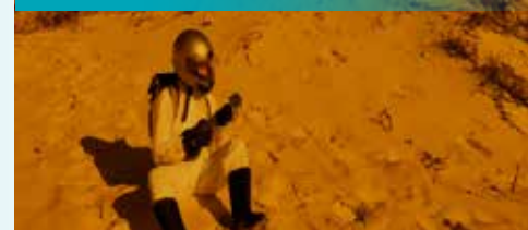
Mars Maybe Not (2022) Great Southern Grammar