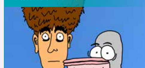
Lemon and the Pelicans (2022) Great Southern Grammar