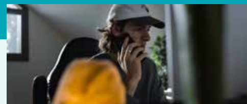
Aversion (2022) Bunbury Cathedral Grammar School