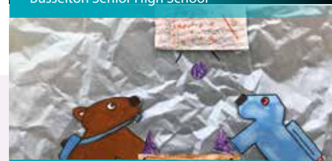
W-FILES (2022) Great Southern Grammar