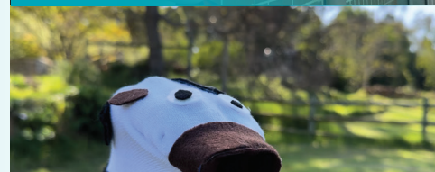
Noah's Banana Boat (2023) Great Southern Grammer