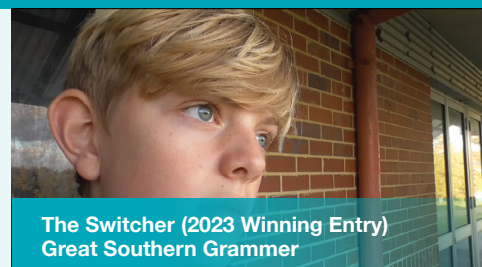
The Switcher (2023 Winning Entry) Great Southern Grammer