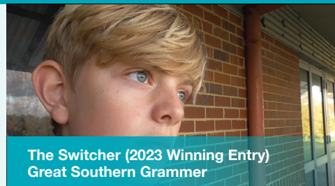
The Switcher (2023 Winning Entry) Great Southern Grammer